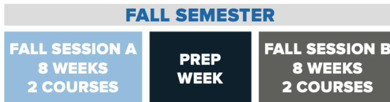
Table 1: Typical NPP Semester

To allow students consistency across their programs, Northwest has structured each of their classes (with some exceptions in HyFlex programs) to proceed in the following weekly format: