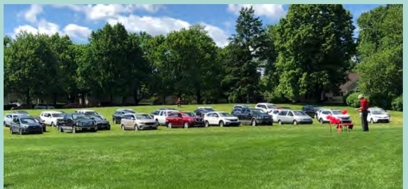
Creativity & adaptability were essential this year in all aspects of ministry!