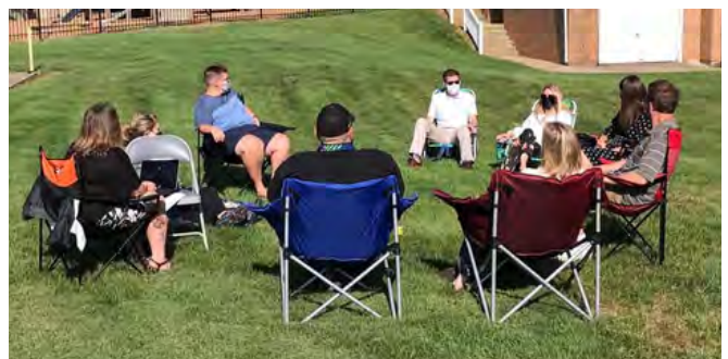
Faith Formation: St. Paul Lutheran Church offered over 10 study groups that ran continually throughout 2020.