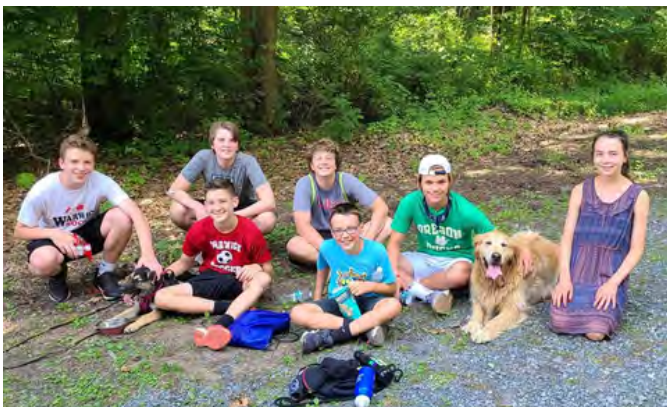
St. Paul youth on a summer hike.