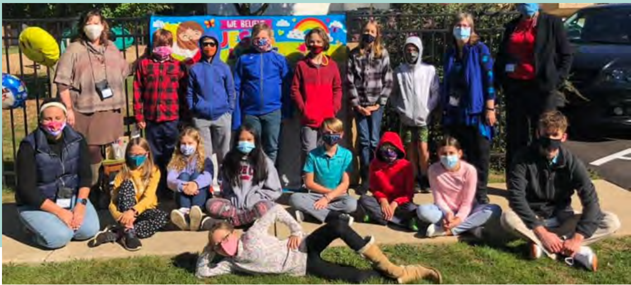
Sunday School remained outside while the temperatures were still comfortable.