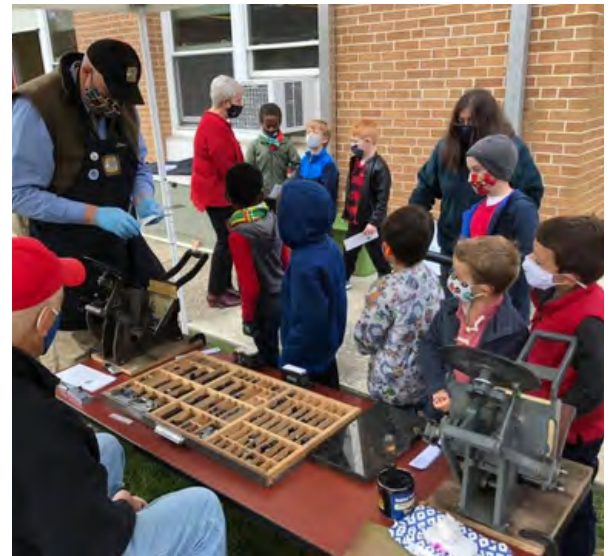
Heritage Press brought its mobile museum to St. Paul for Reformation Sunday!