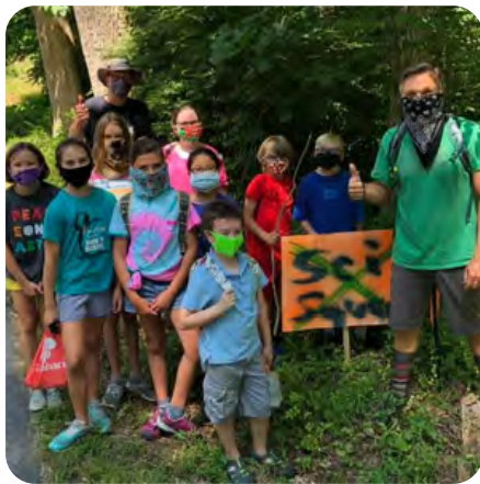
Science Squad kept the kids busy discovering treasures in the woods & streams.