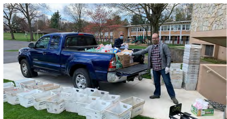
We supported local food drives.