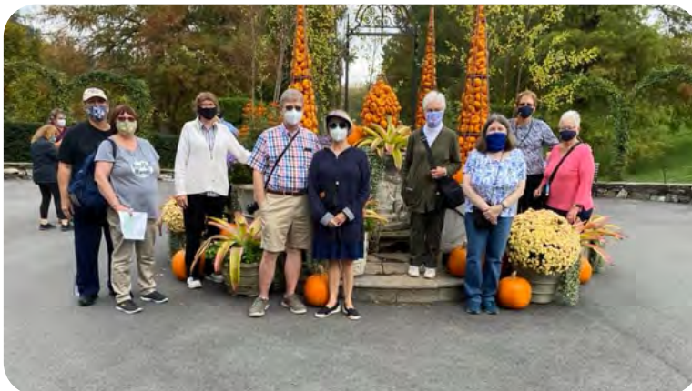
The Adult Choir on a field trip to Longwood Gardens

How has St. Paul supported you/ kept you connected this year?