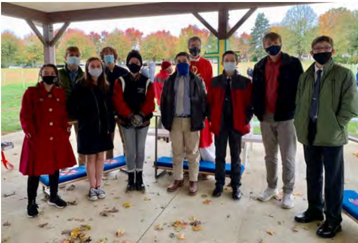
Confirmation class of 2020

I don't think my family would have survived without the assistance of our St. Paul family. They have prayed for each and every member of my family during various struggles. Several St. Paul members have provided me with dinners weekly. 12 members of St. Paul helped me pack up my house and get it ready to sell. I have reached out to St. Paul members on a moment's notice when I had an emergency. When I have needed help, it was my St. Paul family that I knew I could turn to! The Holy Spirit is clearly present within our congregation.