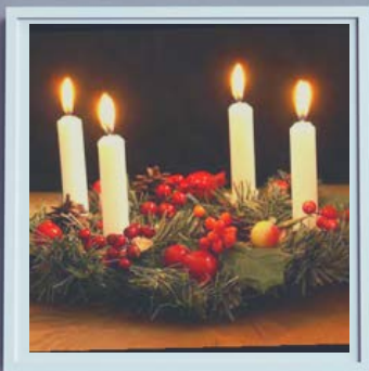
Make an Advent Wreath