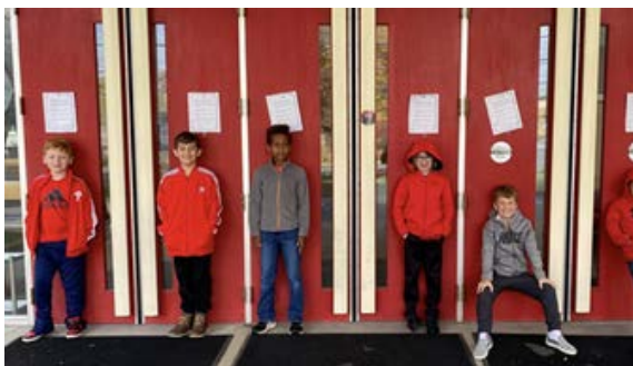
"Nailing" 95 theses to the church doors on Reformation Day

We like to go BIG on Reformation Day for kids at St. Paul. This year, we held an afternoon event tailored to families new to the Lutheran heritage. We explored the Reformation through interactive stations around Faith Alone, Grace Alone and Word Alone. A shared meal ended a wonderful evening for families to talk about faith, church and the love of Jesus!