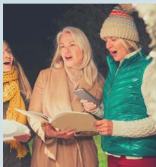
Caroling & Cocoa