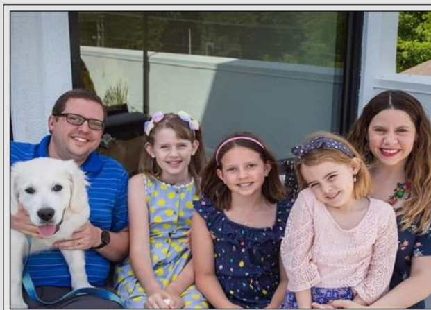
THE KOCH FAMILY