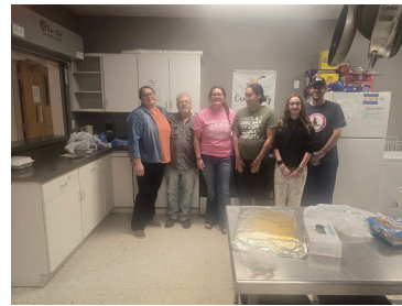
SOLID worked the Community Cafe on Monday.