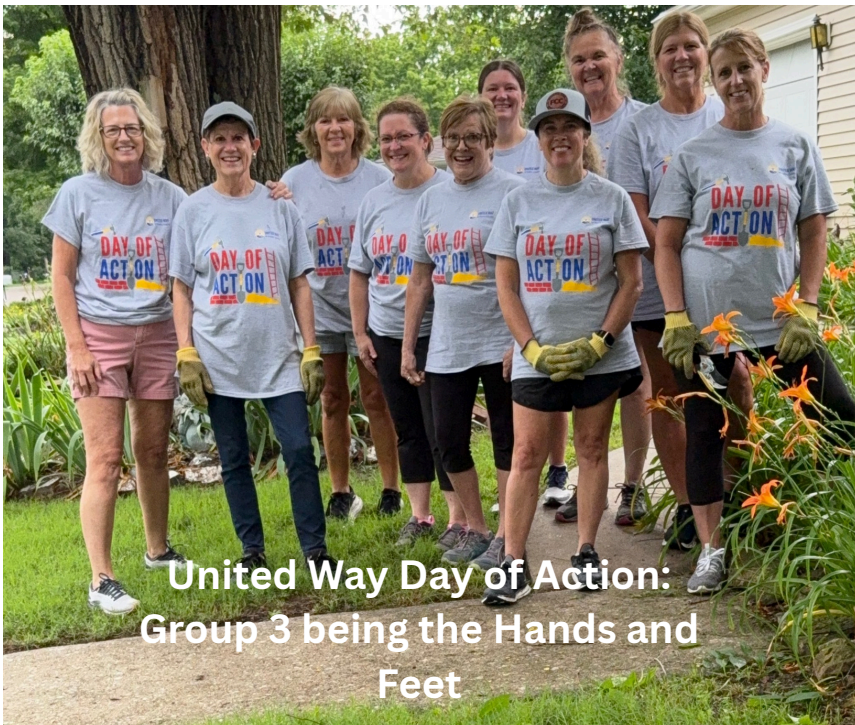
United Way Day of Action: Group 3 being the Hands and Feet