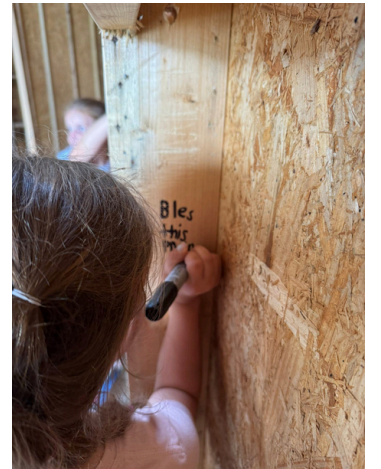
Mission Team in St. Louis