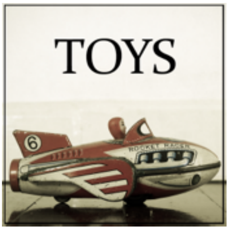
Give by Sat. 12/12

Items going to Operation Christmas Child.