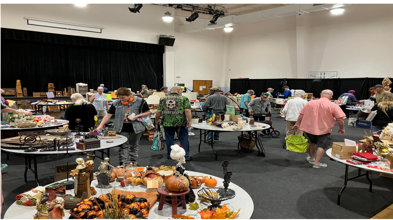
Lots of good stuff . . . thanks to all who donated