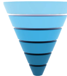
God's Standard: The Closed Funnel