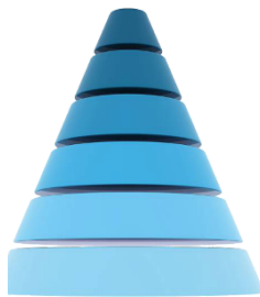
The World's Standard: The Open Funnel