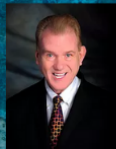
Evangelist & Motivational Speaker,

Mission of Hope Ministries 50 Years of Hope