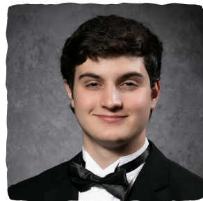
JACKSON DOSS HOMELIFE ACADEMY