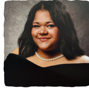
KAYDERAI BULLION OCCHS