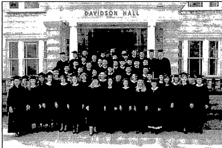
The Class of 1998