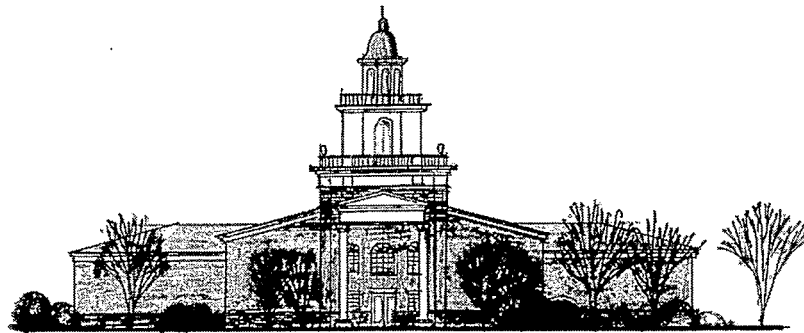
The chapel at the new campus

What can be done to help? Prayer is the most important thing that can be done to help the process. If God does not build the house, the work is in vain. Pray that the campus will be sold and at a price we must have in order to continue our forward momentum. Pray that God will continue to impress His people to help undergird the process financially.