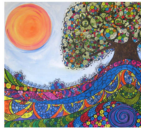
Tree of Hope

* Asterisks invite us to rise in body or spirit.