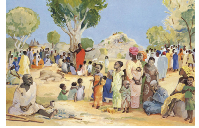
Sermon on the Mount, Jesus Mafa, Cameroon ©1973

The peace of our Lord Jesus Christ be with you. And also with you.