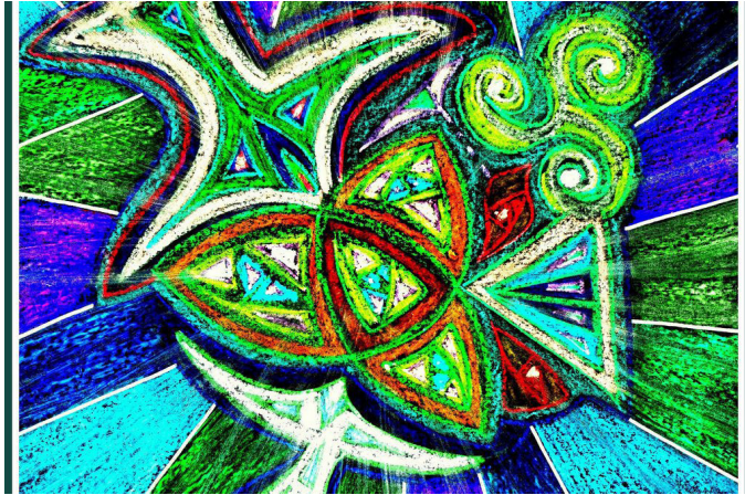
Triune Heart of the Universe, Stushie Art

Trinity Sunday Sunday | May 31 | 2026 9:30 a.m. | 11:00 a.m.