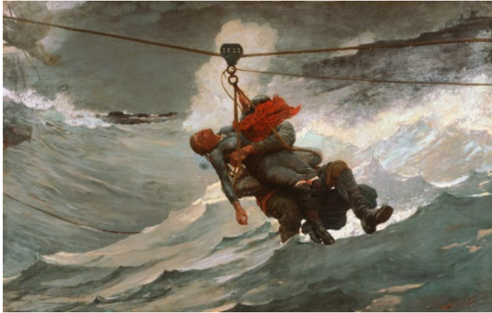
Life Line , 1884, Homer Winslow (1836-1910)

Fourth Sunday After Pentecost Sunday | June 21 | 2026 9:30 a.m. | 11:00 a.m.