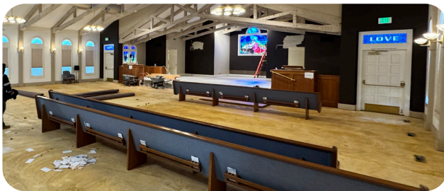
Daybreak Meadowlark Chapel Mid-Demo

Go First Team at Daybreak Meadowlark - Pray for the team and families who are choosing to make Daybreak Meadowlark their home— that God would unite them, strengthen their faith, and use them to reflect Christ's love in the community.