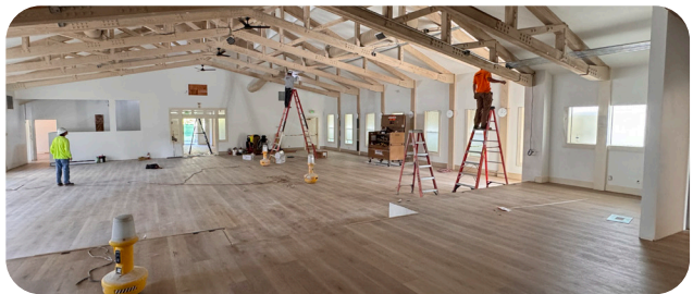
Daybreak Meadowlark Chapel Mid-Renovation

"I am honored and grateful to be part of God building His Kingdom through our church in a new area. We are excited to serve one of the fastest growing communities in our county. We believe this campus will be a powerful extension of what God has been doing through Daybreak over the last few years!"