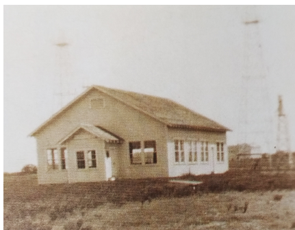
This was the original church building, and now constitutes the north end of our education wing. It has been in continuous use since 1932.

The church began with a small group in the Elm Grove School (three miles east of Van), and within a few years (1921) they became Union Chapel Baptist Church. Eleven years later Union Chapel Baptist moved to the growing community of Van (oil had been discovered in 1929) and became the First Baptist Church of Van, Texas. The first portion of the church site was acquired in February 1932 and the church was incorporated in April 1932.