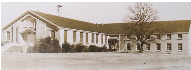
This sanctuary was built in 1947 and remodeled in 1967. Currently, it is used as our Youth facility.

As the church membership grew, the physical facilities grew to meet the needs of the worship service, the Sunday School and other activities. A baptistry was added in 1941 and a new sanctuary was constructed in 1947 and remodeled in 1967.