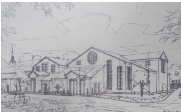
A draft of the MPB, which was dedicated in 2007.

In more recent history, the facility expanded once again to meet the growing needs of the church and community. A brand new multipurpose building containing a beautiful foyer, a state-of-the-art gym, a new kitchen, and a wing of seven classrooms was dedicated on the church's 75 th anniversary in 2007.