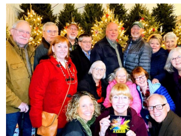
Varsity A-Team members