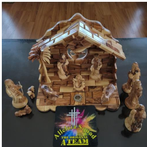
Maybelle Fullhart's Nativity scene!