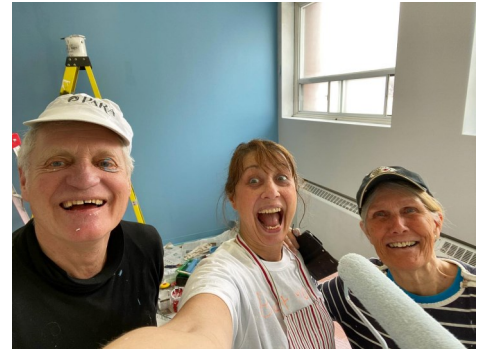
Painting the Youth Room

The journey through COVID has been long, but we hope to rebuild a sense of BELONGING within this fledgling group of five teenagers with the help and nurturing of St. Matt's adult congregation.