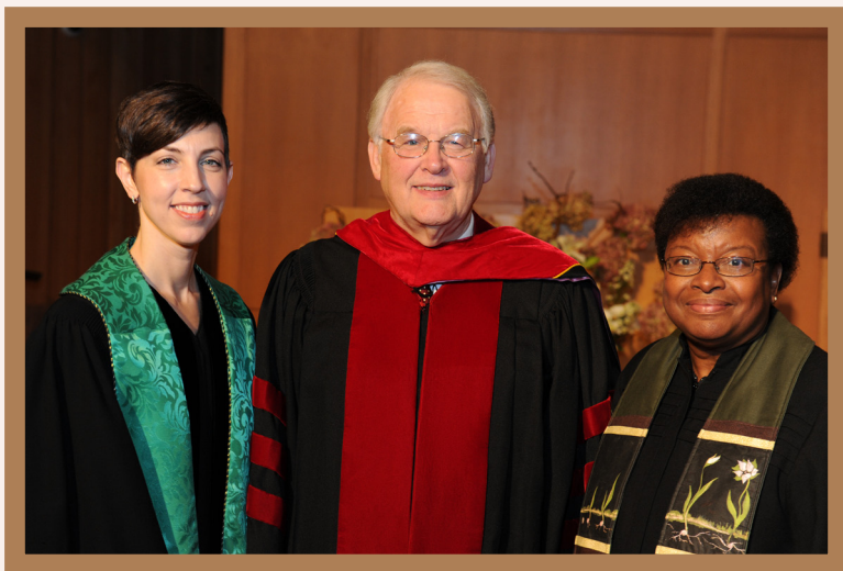
Shelter Rock Ministers

The Unitarian Universalist Congregation at Shelter Rock is a religious home where you and your family can come together for events in life that challenge us, inspire hope, call forth our prayers and bring joy. As a liberal faith, Unitarian Universalism is accepting of all religious backgrounds, beliefs, and traditions. We invite you to honor life's transitions led by a member of our ministry team. You and your family will be guided through these important moments with personalized attention and care.