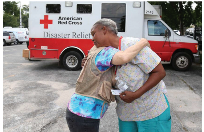
Mercy Ministry sent supplies and $4,000 to aid victims of devastating flooding.