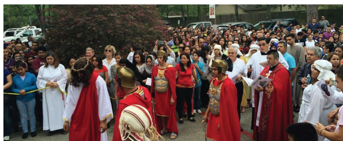
Bilingual Stations of the Cross

Through the services provided by the Spanish Ministry and Bonding Against Adversity, more than 250 people from Prince of Peace have received their citizenship