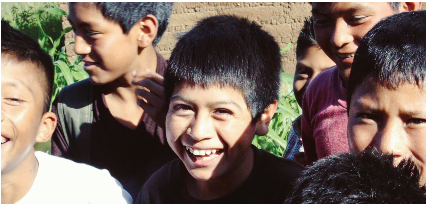
POP missionaries offered spiritual formation and delivered $10,000 in aid to our brothers and sisters in Guatemala.