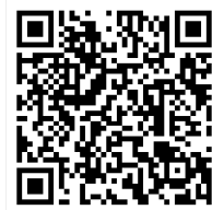
ONE Class Registration

Classes meet on Monday evenings from 7:00 to 8:30 PM. (Free childcare is available upon request.) After completion of the series participants are welcomed to prayerfully consider official membership as part of the St. John family. For more please contact church@stjohnrochester.org or call the Pastoral Office at 248-402-8020. We hope you can join us! Register now by scanning the QR Code or visiting: https://www.stjohnrochester.org/event/one-class-membership-class/