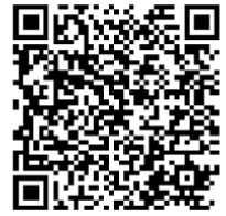
ONE Class Registration

Classes meet on Monday evenings from 7:00 to 8:30 PM. (Free childcare is available upon request.) After completion of the series participants are welcomed to prayerfully consider official membership as part of the St. John family. For more please contact church@stjohnrochester.org or call the Pastoral Office at 248-402-8020. We hope you can join us! Register now by scanning the QR Code or visiting: https://www.stjohnrochester.org/event/one-class-membership-class/