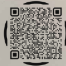
YouTube Daily Devotionals