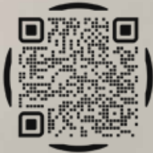
YouVersion Bible Website

Follow the reading plan on YouVersion Bible App (scan QR code below, or click the QR code if viewing online). The daily videos can be found on YouTube (scan or click QR code).