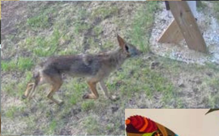
A coyote having a little time with Jesus at our Prayer Garden