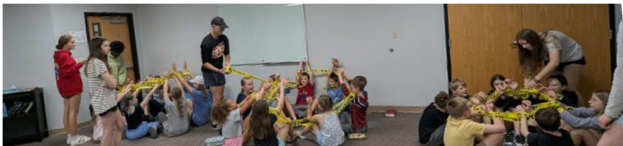
Kids playing a game where they made a human basket.