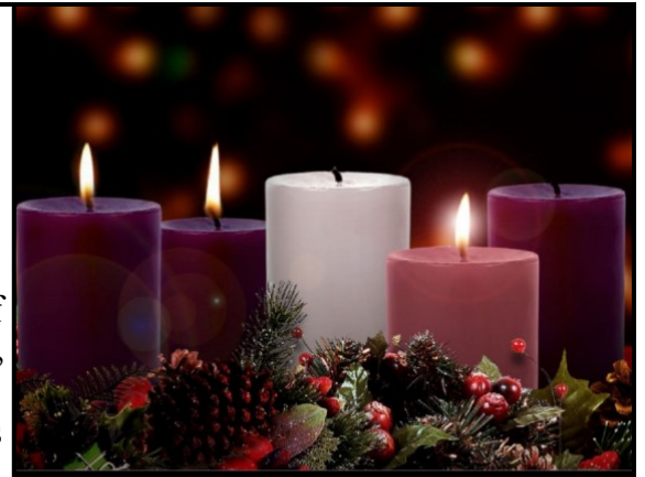
Gaudete Sunday: The Third Sunday in Advent

The word "Gaudete" is Latin for "Rejoice." This celebration is a reminder that God who loves us is still in charge and that we await his coming not with fear, but with tremendous joy. Today's Second Reading, from the First Letter of St. Paul to the Thessalonians, reflects this joy: "Brothers and sisters: Rejoice always. Pray without ceasing. In all circumstances give thanks, for this is the will of God for you in Christ Jesus."