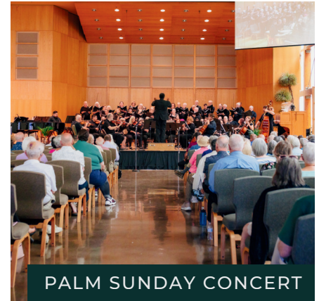
PALM SUNDAY CONCERT

Special thanks to our dedicated staff, ensembles, solo musicians, special groups, and all the volunteers who enhance our worship services every week. All is done in praise to God and to His glory!