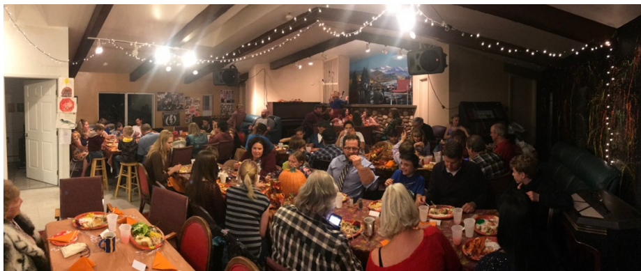
The Rock House converted to serve 80 mentees, families and mentors