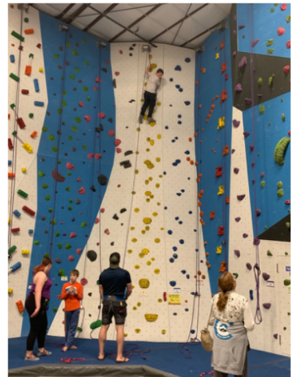
March 5 th : Climbing Day at Earth Treks