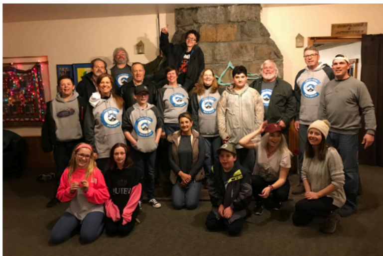
February 26 th : Easter Seals Community Service Project