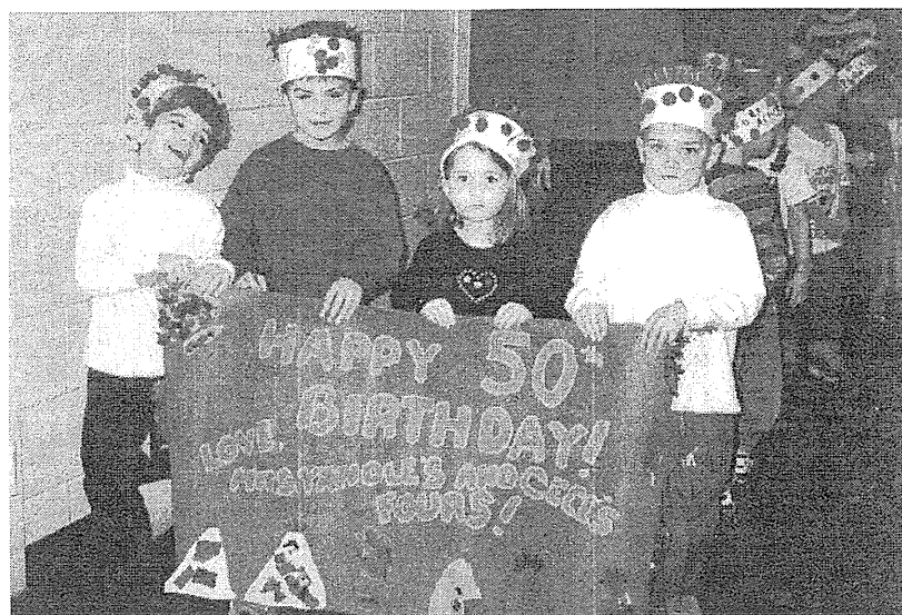
Shandon UMC Preschool & Kindergarten celebrated 50 years of Christian learning on Wednesday, Jan. 23 with a birthday party. The children made banners and party hats and had a big birthday cake.

Human, cat and dog bites have a high risk of infection. All bites, especially those on the hand, should be evaluated by a health care provider. If you notice worsening redness, swelling, warmth or pain or have red streaks pointing toward the heart, SEEK HELP IMMEDIATELY!