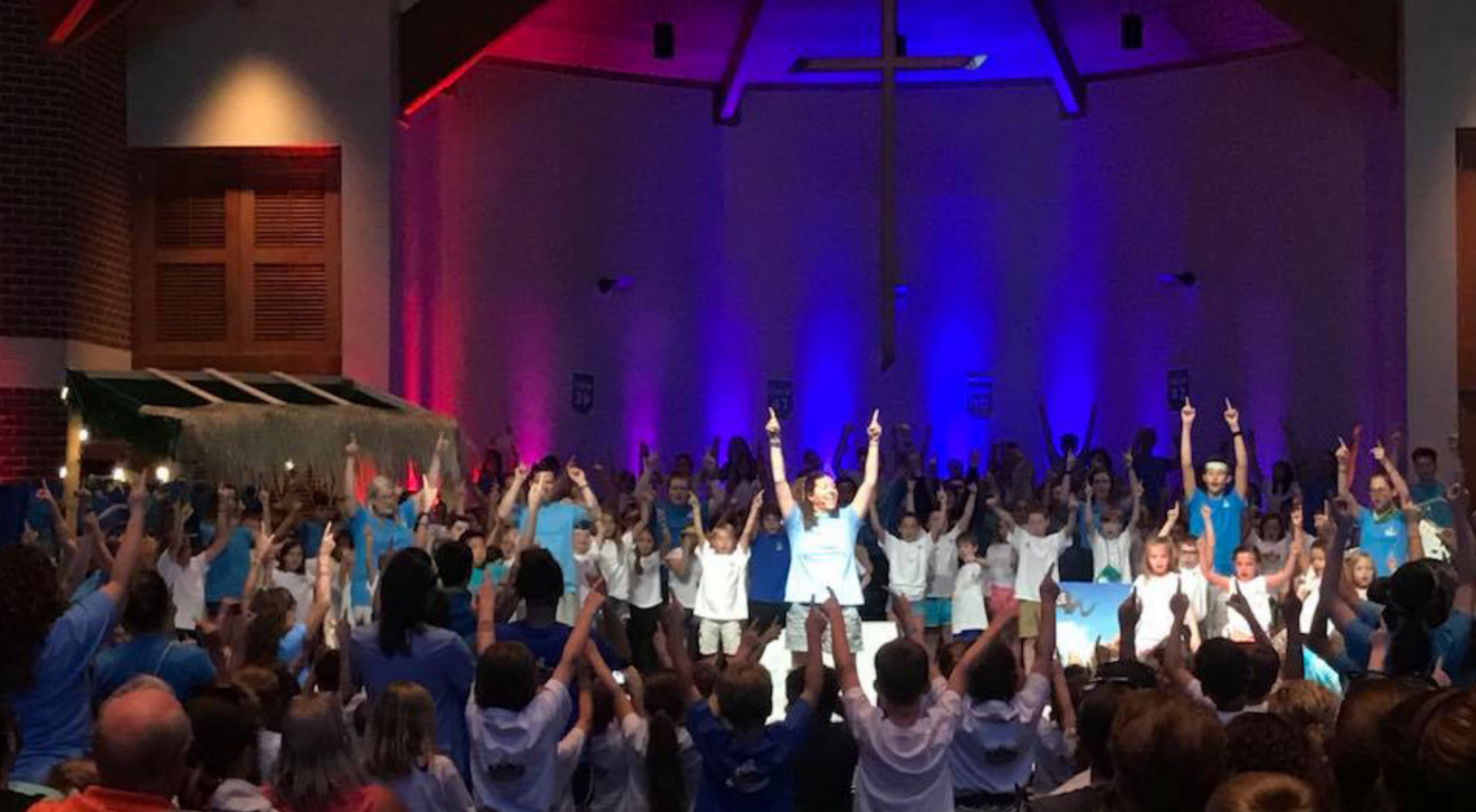
CHILDREN'S MINISTRIES SUMMER OF FUN Clockwise from top: Vacation Bible School, Art Camp: Korea, VBS, Just a Phase Sunday