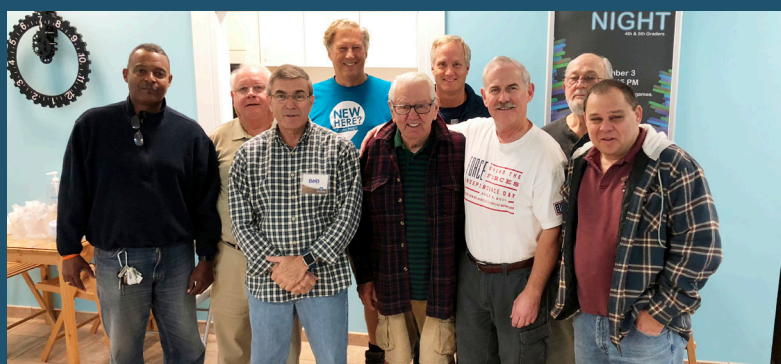
A few of the men of Fuel for Men

It's all about growing our relationships, both with the Lord and with each other. We're a great group for a man who wants to grow in his faith and develop friendships with other Ebenezer men.