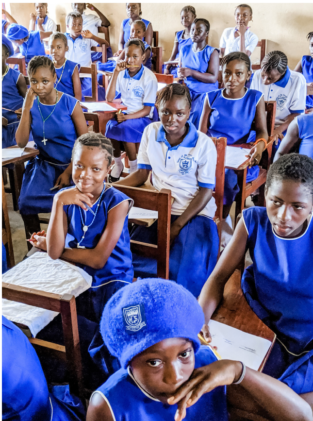
Students in a classroom in Fengehun. Last year the CRC built an additional classroom, but they remain overcrowded. Because so many children start school at different ages and many children have breaks in their education, children are assigned a class based on their ability rather than their age.