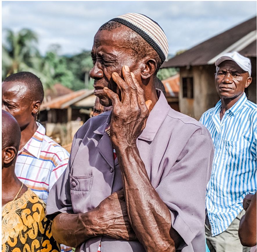
Photo of the Village Chief and some of the elders in Samie village. The chief is responsible for leading the village in decisions to build their economy. The travel team was encouraged by the sense of community in Samie and impressed the entire village showed up for the planning meetings.