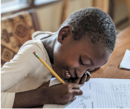
Kids who participate in HCW's Sponsor-A-Child program meet at the CRC regularly to write letters to their sponsors.