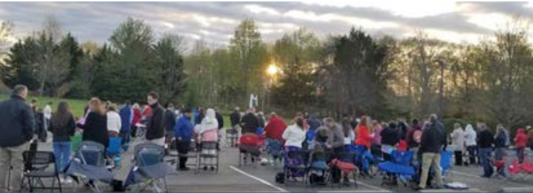
Our Easter sunrise service was a beautiful way to start a very special day! Thanks to all who joined us to celebrate Christ's resurrection on Easter Sunday.