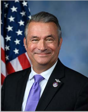
CONGRESSMAN DON BACON

When you live a good life, you silence your critics. (v15)