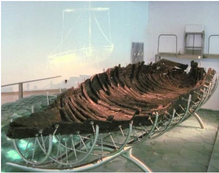
The Galilean Boat