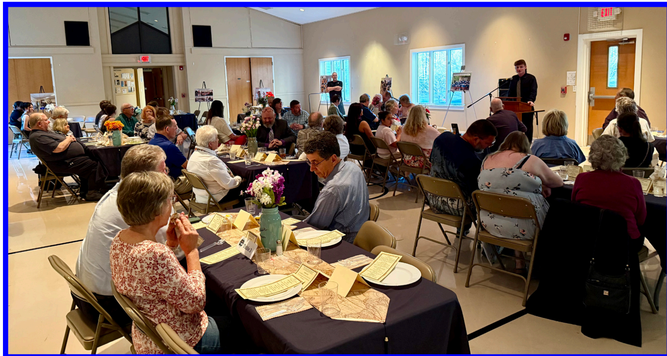
DINERS HEARING TESTIMONY FROM THE YOUTH ON THEIR PREVIOUS YEAR EXPERIENCES

Donations can still be received by designating “Youth” via cash or check, turned in at the church, or online at www.lowchurch.org/give .