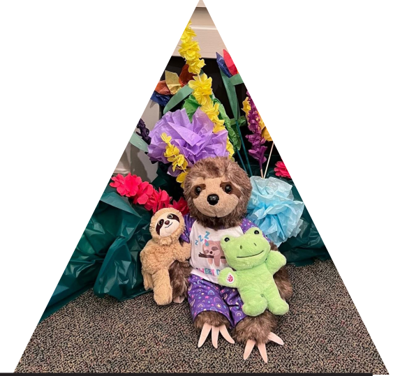
Above: Jungle Characters