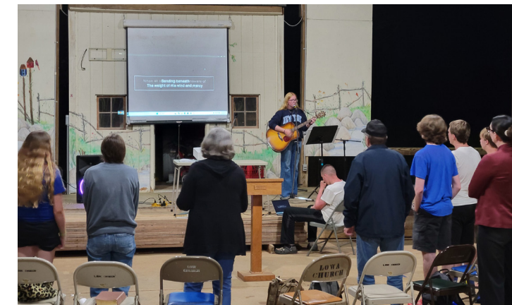
Above: Teen Camp Nightly Worship

We praise God for every moment, every conversation, every decision, and every step of growth. May the seeds planted this week bear fruit for years to come.