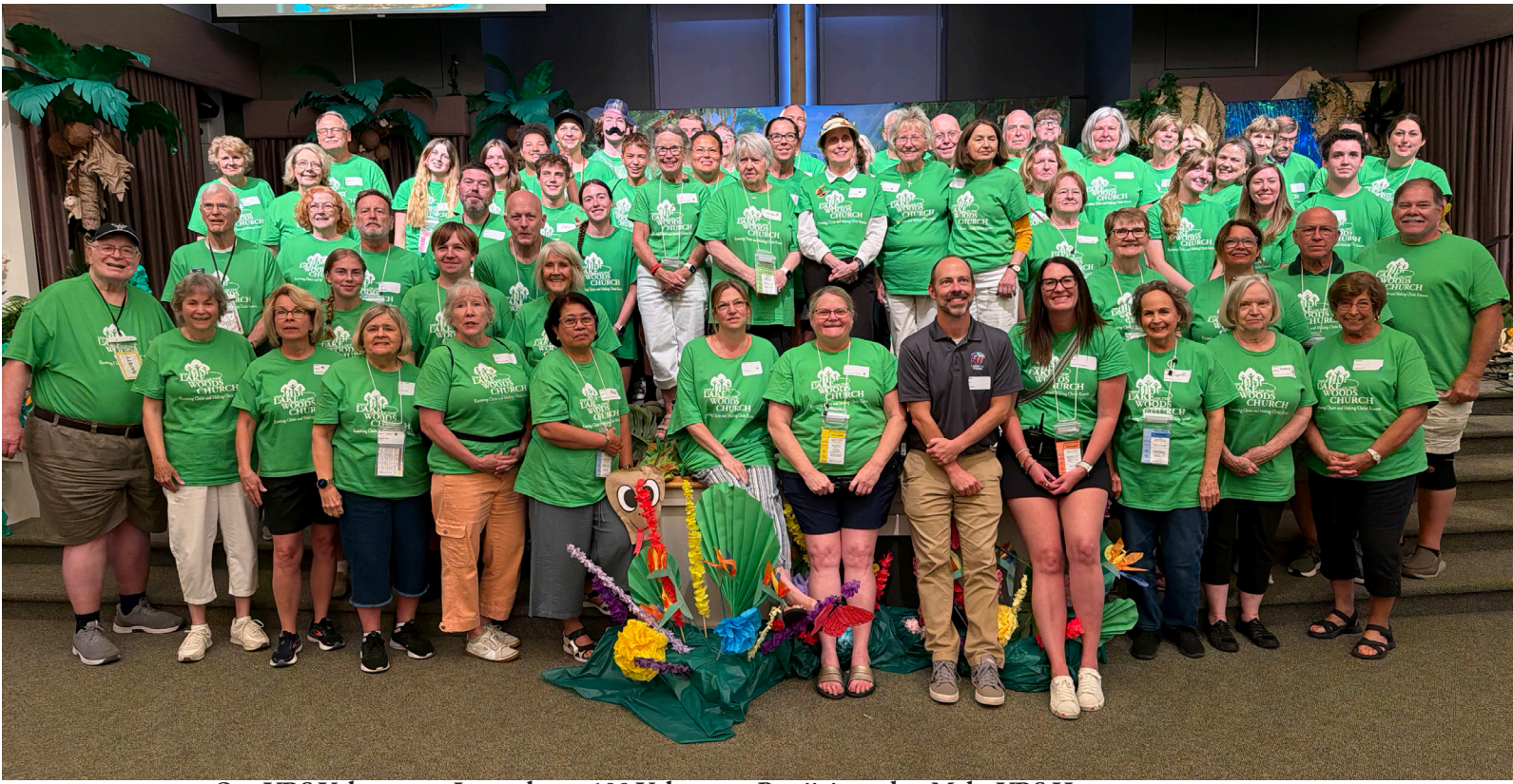
Our VBS Volunteers - In total over 100 Volunteers Participated to Make VBS Happen