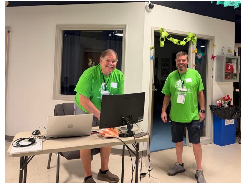
Left: Keeping the Discovery Zone Safe