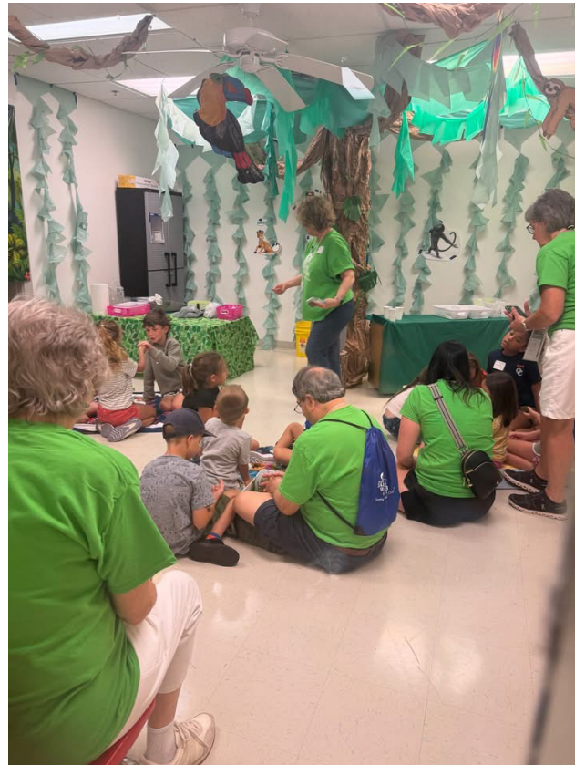
Above - Imagination Station- Children were organized in mixed age groups with adult leaders

We are grateful for all that God accomplished during our week at Rainforest Falls and look forward to seeing how He continues to work in the hearts and lives of these children and their families.