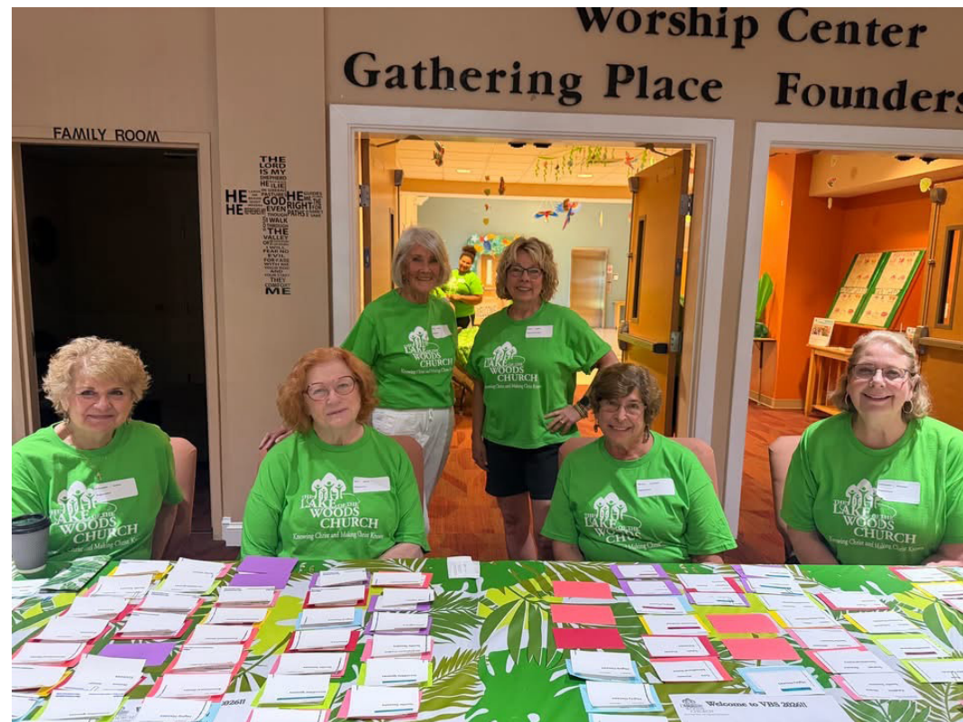
Left - Registration Desk Responsible for checking in and checking out all the children with their families.