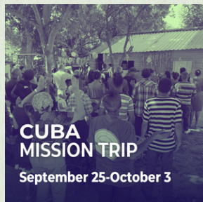
CUBA MISSION TRIP