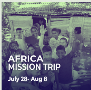
AFRICA MISSION TRIP

Please be praying for our teams going to Africa, Cuba, New York City, as well as those church members traveling with The Bucket Ministry, our student missionaries, and one headed to serve in Oregon!