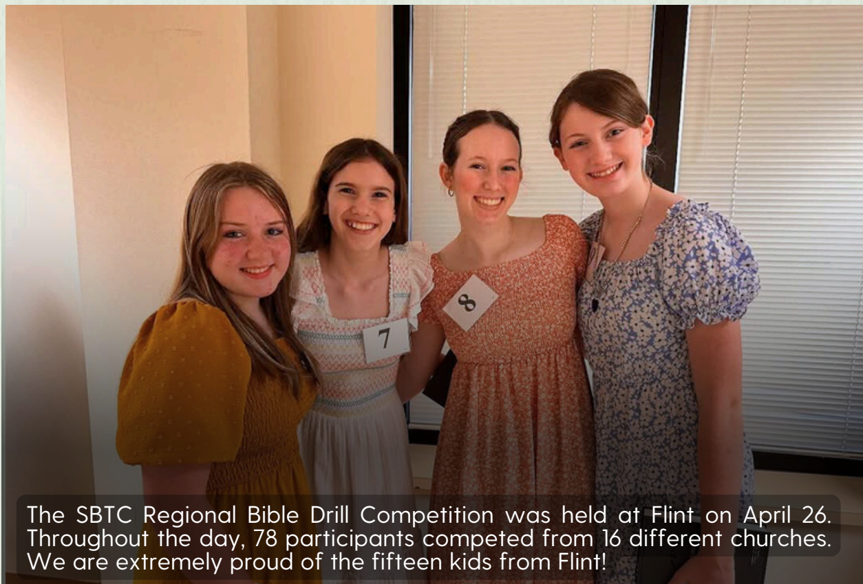
The SBTC Regional Bible Drill Competition was held at Flint on April 26. Throughout the day, 78 participants competed from 16 different churches. We are extremely proud of the fifteen kids from Flint!