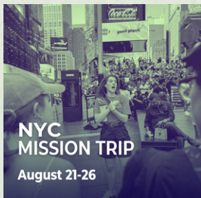
NYC MISSION TRIP