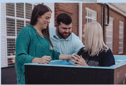
August 4, 2024 We moved from Gray8Skate to Knox Auditorium for Sunday Services