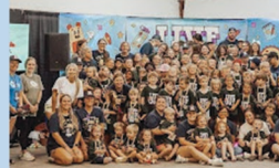
June 8-11, 2025 Kids Camp