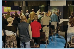
February 12, 2023 2nd Soft Launch Service