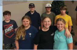
Sept 17, 2023 Student Ministry Launched