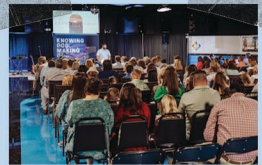
March 31, 2024 Easter Service