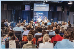
April 7, 2024 Our First Anniversary