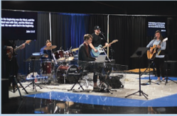
January 8, 2023 1st Soft Launch Service