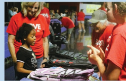
July 21, 2024 1st Back to School Bash