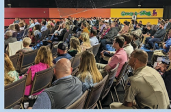
April 9, 2023 Easter & Launch Day Service