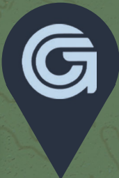
August 1, 2025 Whatever It Takes Campaign Launched