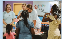
July 19, 2025 2nd Back to School Bash