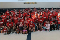
June 29, 2025 2nd Annual Serve Day