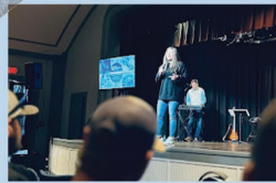
February 23, 2025 100th Sunday Service