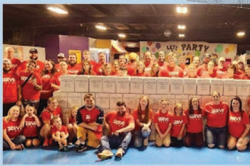
June 2, 2024 1st Serve Day