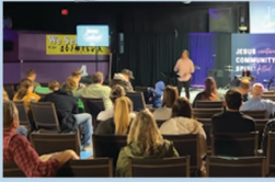
March 12, 2023 3rd Soft Launch Service