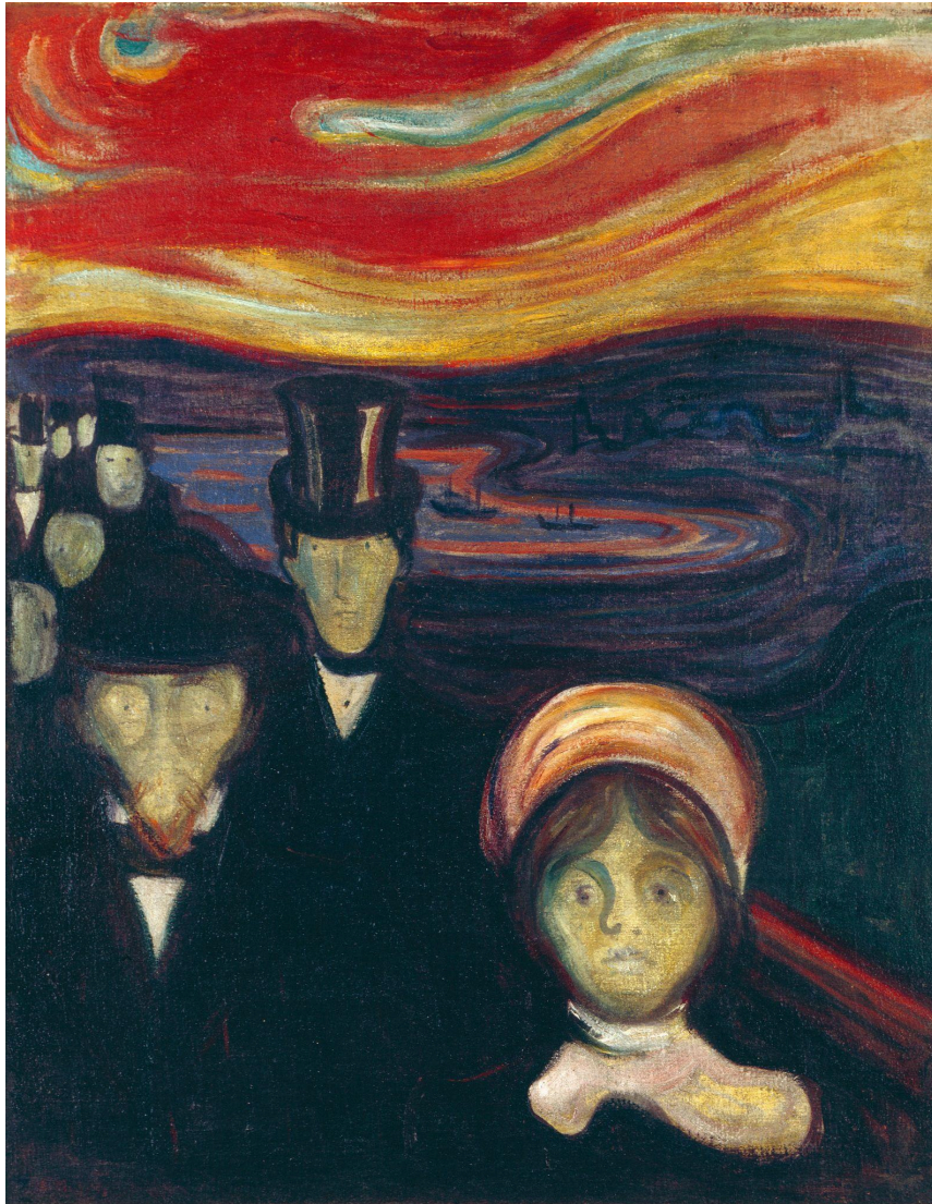
Anxiety (Norwegian: Angst ), Edvard Munch, 1894