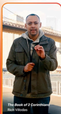
The Book of 2 Corinthians Rich Villodas