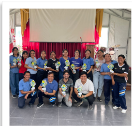
Our NLCS Graduates

We are so thankful for each of you that partner with us to reach these communities and reach these children for Christ!